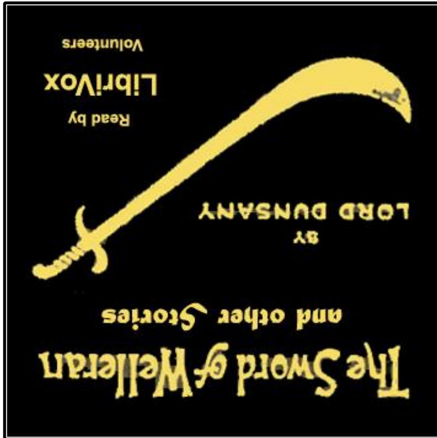
Cover image from 1st edition, published 1909 Cover design for LibriVox by Michele Fry.

Easy Folding Instructions for this Origami CD case, including step by step photos, can be found here . Can also access from the LV Wiki page, CD Covers.